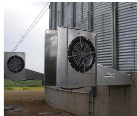
AERATION & CONDITIONING