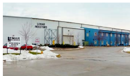
DES MOINES, IOWA