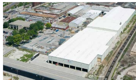
KANSAS CITY, MISSOURI