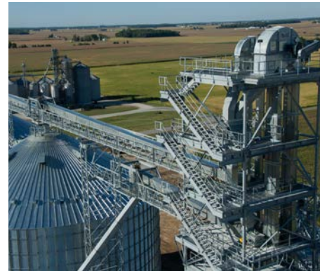
CONVEYORS & SUPPORT STRUCTURES